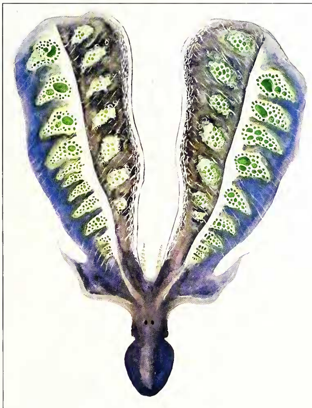
Fig. 3. Tremoctopus gracilis figured by Voss & Williamson (1972) under the name T. violaceus .